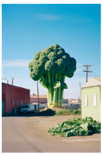
© Bruce Eesly, Broccoli farm near Limburg, 1962 , from the series New Farmer, 2023