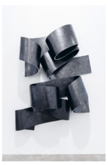
© Wanda Stolle, in between, 2024