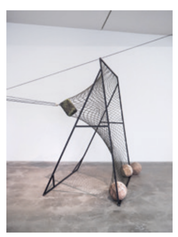
© Abie Franklin, stalemate, Exhibition view ZAK Spandau, 2024