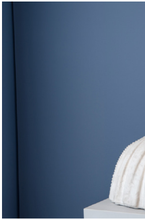
© Andrea Wilmsen, B.ODE #10 , 2019