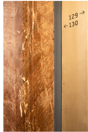
© Andrea Wilmsen, B.ODE #17 , 2019