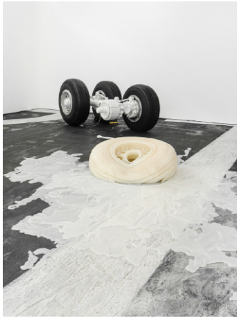
© Daniel Hölzl, END-OF-LIFE, cycle four , 2022