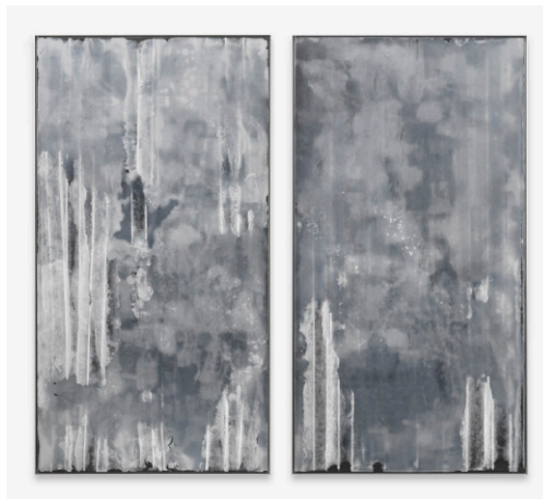
© Daniel Hölzl, Grounded Tarmac No. I and No. II , 2022, Courtesy DITTRICH & SCHLECHTRIEM, Foto Jens Ziehe