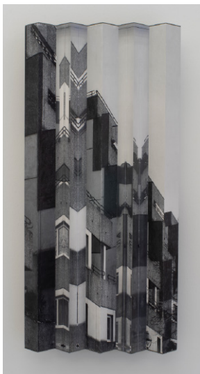
© Sinta Werner, Geteilte Aufmerksamkeit II , 2023