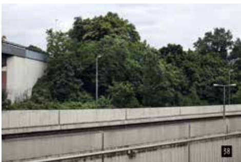
© Daniela Friebel, from the series Revier , 2018