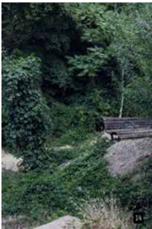
© Daniela Friebel, from the series Revier , 2018