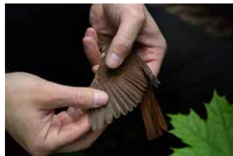
© Daniela Friebel, from the series Revier , 2018