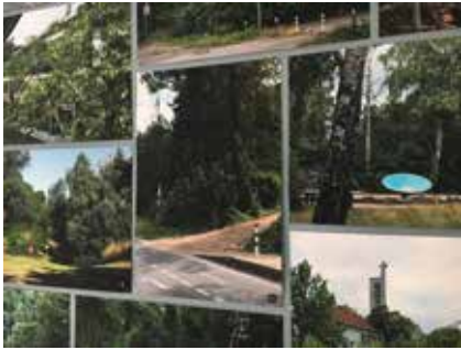
© Daniela Friebel, Revier , 2019, exhibition view