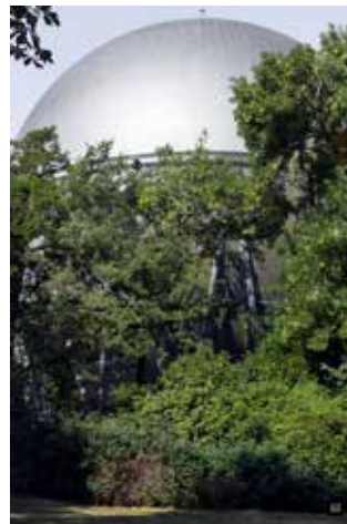
© Daniela Friebel, from the series Revier , 2018