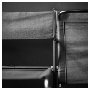
© Stefan Berg, hall seating with seating and backrest