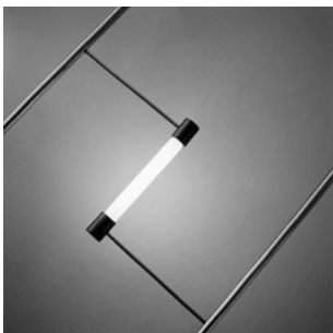
© Stefan Berg, Lighting in the vestibule