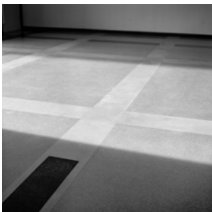
© Stefan Berg, Light and shadow play in the vestibule