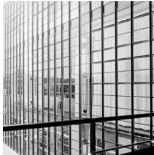
© Stefan Berg, view to the east facade