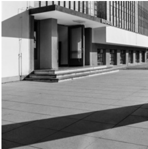
View to the main entrance