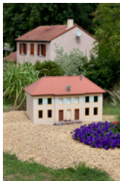
Manderen in France, 2015