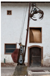
© Ruth Stoltenberg Perl-Wochem in Germany, 2015