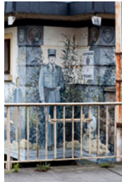
Bad Mondorf in Luxembourg, 2015