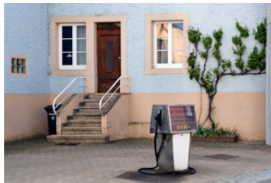
Schengen-Remerschen in Luxembourg, 2015