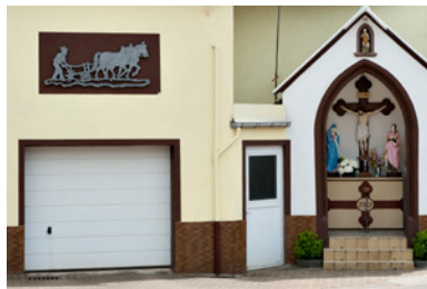
© Ruth Stoltenberg Perl-Borg in Germany, 2015