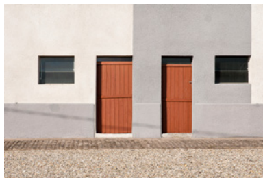
© Ruth Stoltenberg Kirsch-Lés-Sierck in France, 2015