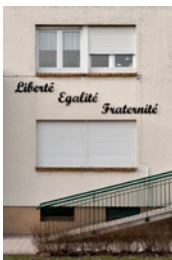
Ritzing in France, 2015