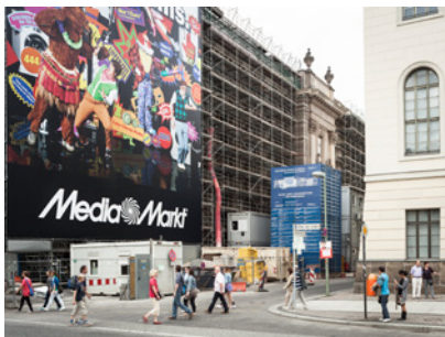
© Peter Bialobrzeski, Berlin, 2011, From the series Die zweite Heimat (The Second Home)