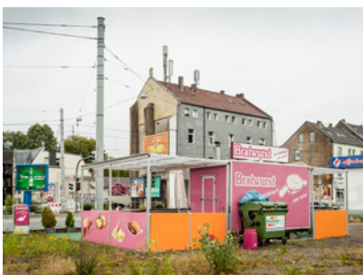
© Peter Bialobrzeski, Bochum, 2012, From the series Die zweite Heimat (The Second Home)