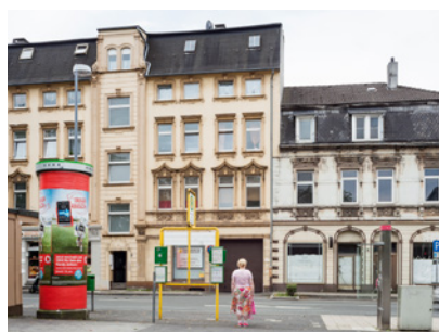
© Peter Bialobrzeski, Velbert, 2012, From the series Die zweite Heimat (The Second Home)