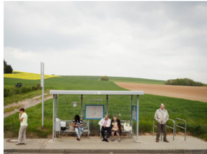
© Peter Bialobrzeski, Ebergötzen, 2011, From the series Die zweite Heimat (The Second Home)