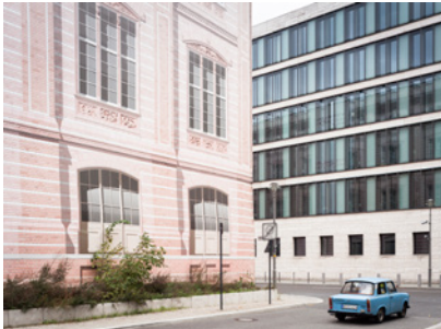
© Peter Bialobrzeski, Berlin, 2011, From the series Die zweite Heimat (The Second Home)