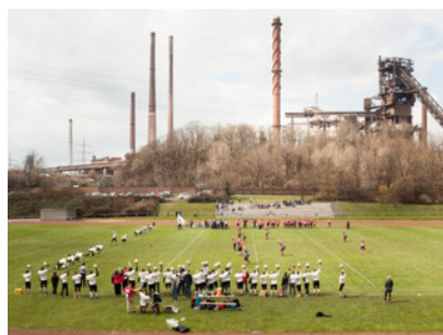
© Peter Bialobrzeski, Duisburg, 2013, From the series Die zweite Heimat (The Second Home)