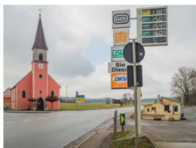
© Peter Bialobrzeski, Waidhaus, 2014, From the series Die zweite Heimat (The Second Home)