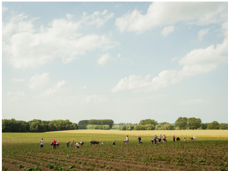
bei Wismar, 2012. From the series Die zweite Heimat (The Second Home)