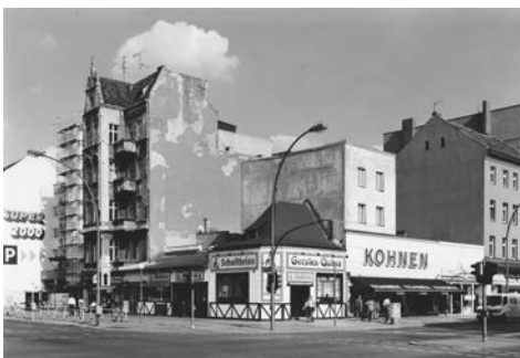
© André Kirchner, Gersten-Quelle, Wedding 1988