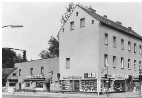
© André Kirchner, Haus der Geschenke, Wedding 1988