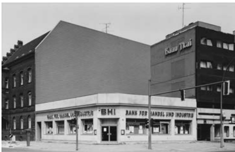
© André Kirchner, BHI Potsdamer Straße, Tiergarten 1988