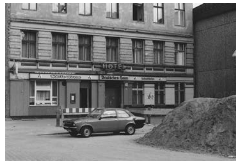
© André Kirchner, Deutsches Haus, Kreuzberg 1989