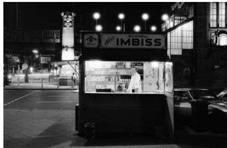
© André Kirchner, Schnell-Imbiss Bülowstraße, Schöneberg 1986