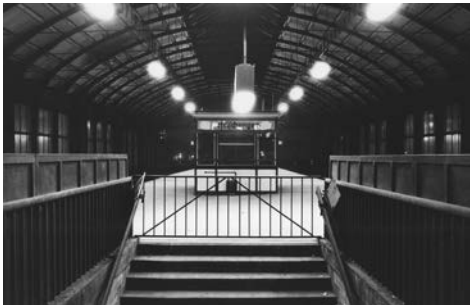
Erfrischungen, Lehrter Stadtbahnhof, Tiergarten 1983