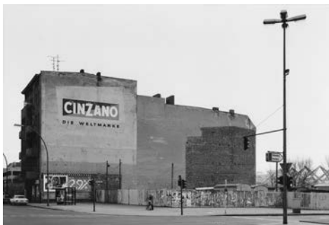
© André Kirchner, Cinzano, Wedding 1989