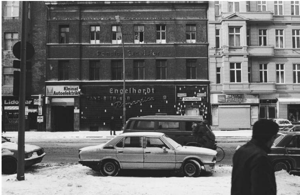
Tanzbierbar Romantica, Schöneberg 1985